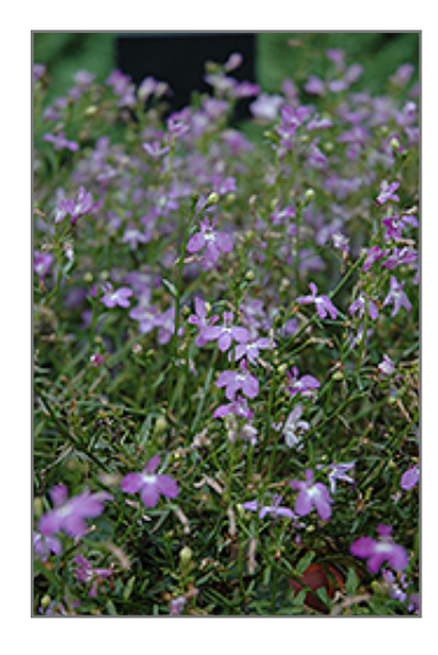
Waterfall Light Lavender Lobelia flowers

Waterfall Light Lavender Lobelia will grow to be about 8 inches tall at maturity, with a spread of 12 inches. When grown in masses or used as a bedding plant, individual plants should be spaced approximately 10 inches apart. Its foliage tends to remain low and dense right to the ground. Although it's not a true annual, this fast-growing plant can be expected to behave as an annual in our climate if left outdoors over the winter, usually needing replacement the following year. As such, gardeners should take into consideration that it will perform differently than it would in its native habitat.