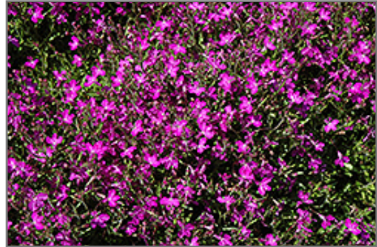
Techno Violet Lobelia flowers

Techno Violet Lobelia will grow to be about 8 inches tall at maturity, with a spread of 12 inches. When grown in masses or used as a bedding plant, individual plants should be spaced approximately 10 inches apart. Its foliage tends to remain low and dense right to the ground. Although it's not a true annual, this fast-growing plant can be expected to behave as an annual in our climate if left outdoors over the winter, usually needing replacement the following year. As such, gardeners should take into consideration that it will perform differently than it would in its native habitat.