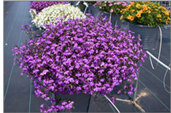
Techno Violet Lobelia in bloom