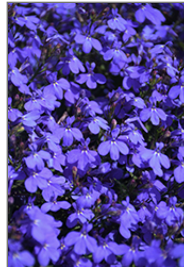
Techno Electric Blue Lobelia flowers

Techno Electric Blue Lobelia is recommended for the following landscape applications;