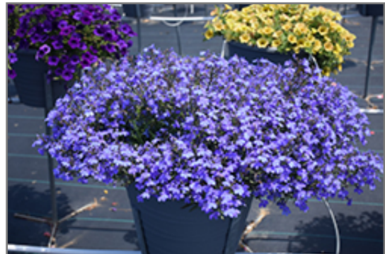
Techno Electric Blue Lobelia in bloom

Techno Electric Blue Lobelia will grow to be about 8 inches tall at maturity, with a spread of 12 inches. When grown in masses or used as a bedding plant, individual plants should be spaced approximately 10 inches apart. Its foliage tends to remain low and dense right to the ground. Although it's not a true annual, this fast-growing plant can be expected to behave as an annual in our climate if left outdoors over the winter, usually needing replacement the following year. As such, gardeners should take into consideration that it will perform differently than it would in its native habitat.