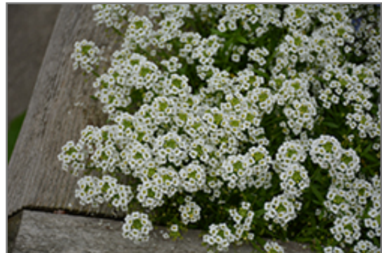
Snow Princess Alyssum flowers

Snow Princess Alyssum is recommended for the following landscape applications;