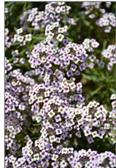
Blushing Princess Sweet Alyssum flowers

Blushing Princess Sweet Alyssum is recommended for the following landscape applications;