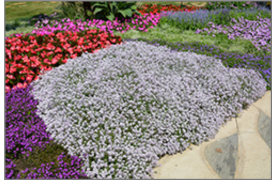
Blushing Princess Sweet Alyssum in bloom

Blushing Princess Sweet Alyssum will grow to be only 6 inches tall at maturity, with a spread of 24 inches. When grown in masses or used as a bedding plant, individual plants should be spaced approximately 20 inches apart. Its foliage tends to remain low and dense right to the ground. This fast-growing annual will normally live for one full growing season, needing replacement the following year.