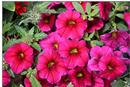
Superbells Cherry Red Calibrachoa flowers