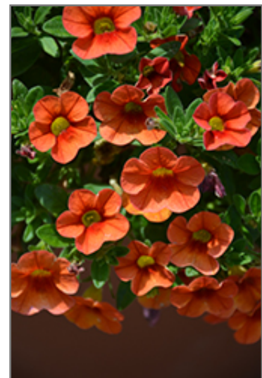
Aloha Hot Orange Calibrachoa flowers