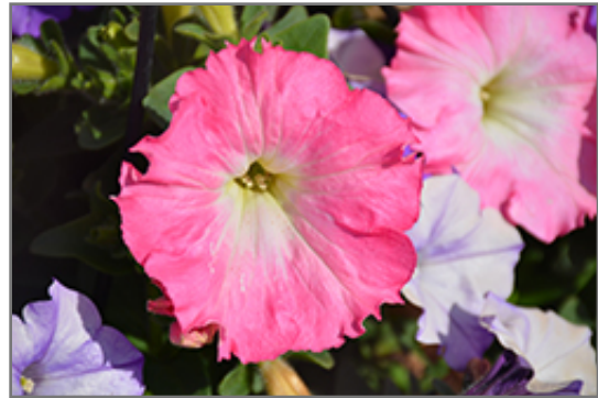
Easy Wave Rosy Dawn Petunia flowers