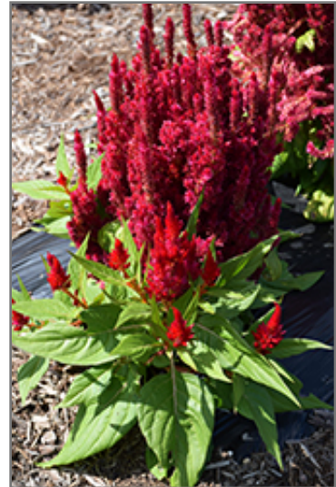
Fresh Look Red Celosia in bloom