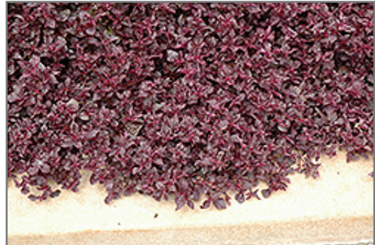
Purple Lady Blood Leaf