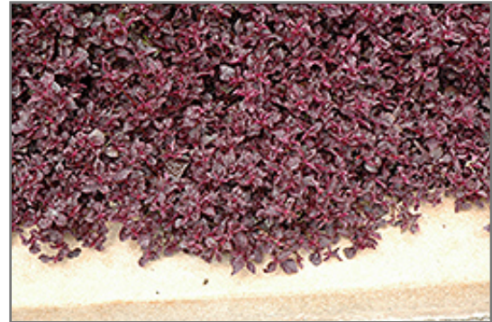
Purple Lady Blood Leaf