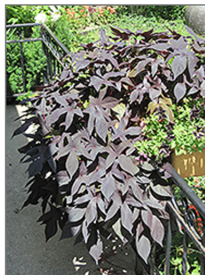
Proven Accents Blackie Sweet Potato Vine