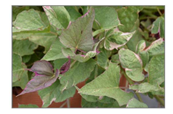
Tricolor Sweet Potato Vine foliage

Tricolor Sweet Potato Vine is primarily valued in the garden for its spreading and trailing habit of growth. Its attractive spiny heart-shaped leaves remain dark green in color with showy pink variegation and tinges of light green throughout the season.