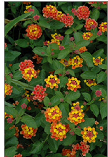
Landmark Citrus Lantana flowers