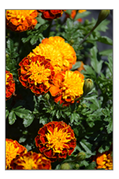
Janie Spry Marigold flowers

Janie Spry Marigold features bold brick red pincushion flowers with yellow centers at the ends of the stems from late spring to late summer. The flowers are excellent for cutting. Its fragrant ferny leaves remain dark green in color throughout the season.