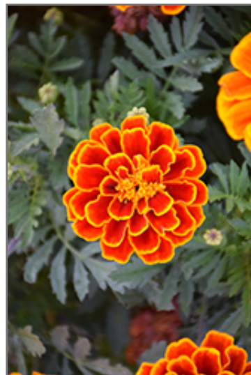
Durango Flame Marigold flowers