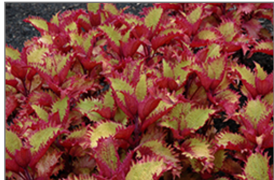
Henna Coleus foliage