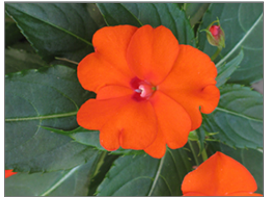
Infinity Orange New Guinea Impatiens flowers

Infinity Orange New Guinea Impatiens is recommended for the following landscape applications;