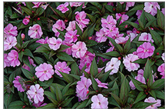
Divine Lavender New Guinea Impatiens flowers