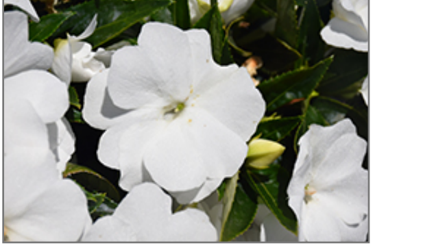
Super Sonic&reg White New Guinea Impatiens flowers