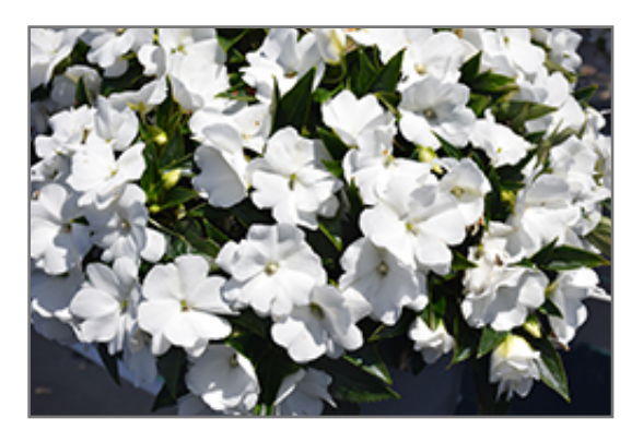
Super Sonic&reg White New Guinea Impatiens flowers