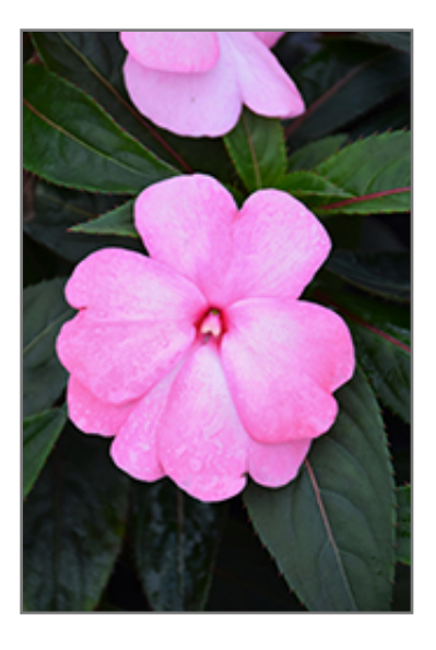
Super Sonic Pastel Pink New Guinea Impatiens flowers