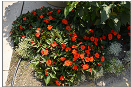
SunPatiens Compact Orange New Guinea Impatiens in bloom

SunPatiens Compact Orange New Guinea Impatiens will grow to be about 24 inches tall at maturity, with a spread of 24 inches. When grown in masses or used as a bedding plant, individual plants should be spaced approximately 20 inches apart. Its foliage tends to remain dense right to the ground, not requiring facer plants in front. This fast-growing annual will normally live for one full growing season, needing replacement the following year.