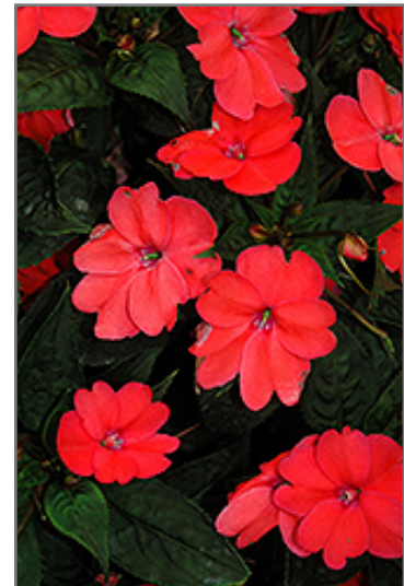
SunPatens Compact Coral New Guinea Impatiens flowers

SunPatens Compact Coral New Guinea Impatiens is recommended for the following landscape applications;