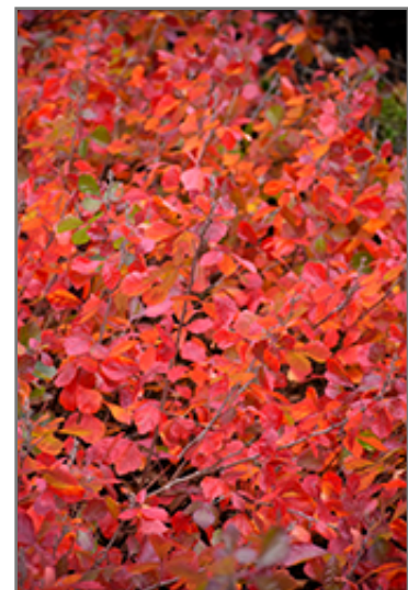
Gro-Low Fragrant Sumac in fall