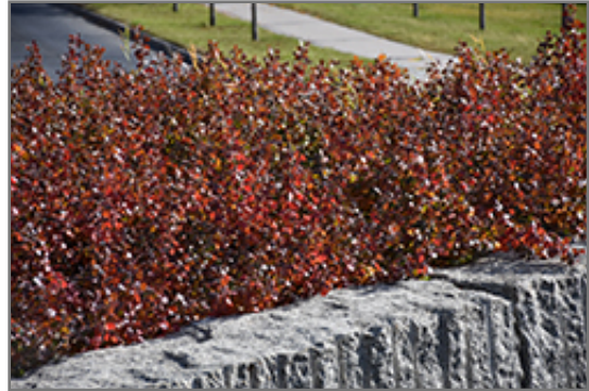
Gro-Low Fragrant Sumac in fall

This shrub performs well in both full sun and full shade. It is very adaptable to both dry and moist locations, and should do just fine under typical garden conditions. It is not particular as to soil type, but has a definite preference for acidic soils, and is subject to chlorosis (yellowing) of the foliage in alkaline soils. It is highly tolerant of urban pollution and will even thrive in inner city environments. Consider applying a thick mulch around the root zone in winter to protect it in exposed locations or colder microclimates. This is a selection of a native North American species.