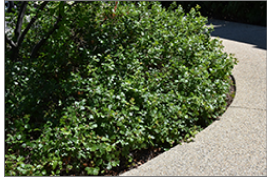
Gro-Low Fragrant Sumac

Gro-Low Fragrant Sumac is recommended for the following landscape applications;