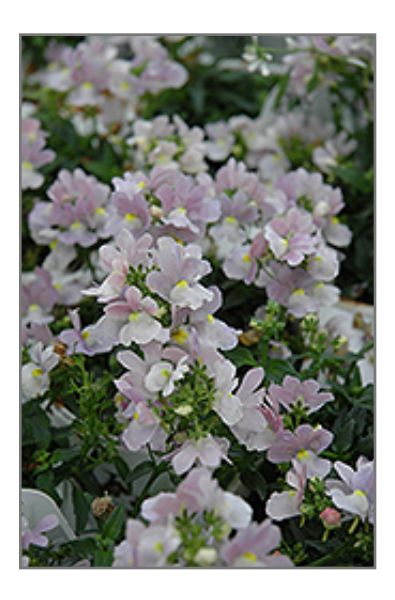
Opal Innocence Nemesia flowers

Opal Innocence Nemesia features dainty spikes of lightly-scented lavender pea-like flowers with purple overtones at the ends of the stems from late spring to late summer. Its small pointy leaves remain green in color throughout the season.