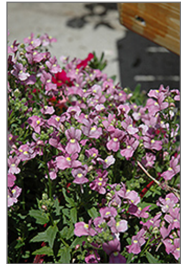
Compact Pink Innocence Nemesia flowers