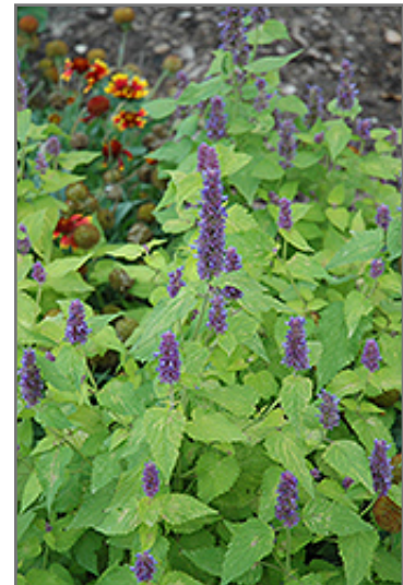
Golden Jubilee Anise Hyssop flowers

This is a relatively low maintenance plant, and is best cleaned up in early spring before it resumes active growth for the season. It is a good choice for attracting bees, butterflies and hummingbirds to your yard, but is not particularly attractive to deer who tend to leave it alone in favor of tastier treats. It has no significant negative characteristics.