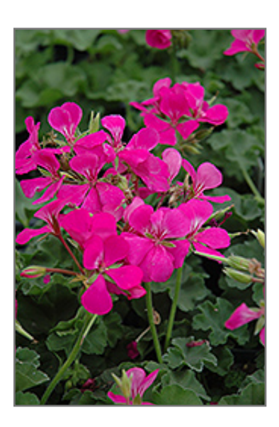
Lavender Ivy Leaf Geranium flowers

Lavender Ivy Leaf Geranium is an herbaceous annual with a trailing habit of growth, eventually spilling over the edges of hanging baskets and containers. Its medium texture blends into the garden, but can always be balanced by a couple of finer or coarser plants for an effective composition.