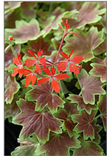
Vancouver Centennial Geranium flowers