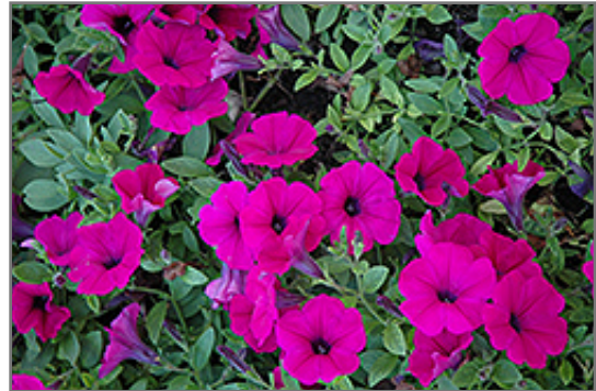
Wave Purple Classic Petunia flowers