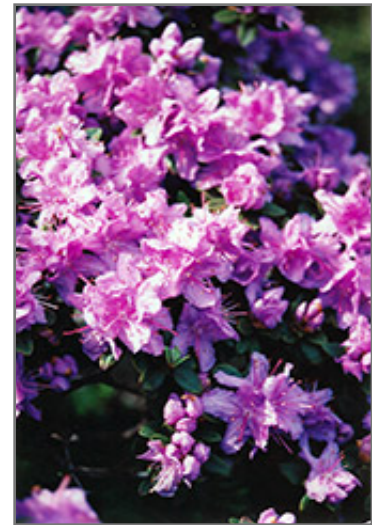
Ramapo Rhododendron flowers

Ramapo Rhododendron will grow to be about 3 feet tall at maturity, with a spread of 3 feet. It has a low canopy. It grows at a slow rate, and under ideal conditions can be expected to live for 40 years or more.