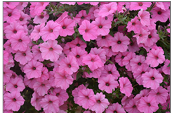
Supertunia Vista Bubblegum Petunia flowers