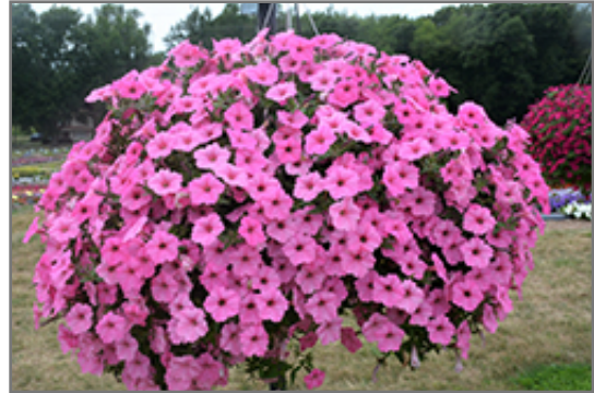
Supertunia Vista Bubblegum Petunia in bloom

Supertunia Vista Bubblegum Petunia is a fine choice for the garden, but it is also a good selection for planting in outdoor containers and hanging baskets. Because of its trailing habit of growth, it is ideally suited for use as a 'spiller' in the 'spiller-thriller-filler' container combination; plant it near the edges where it can spill gracefully over the pot. Note that when growing plants in outdoor containers and baskets, they may require more frequent waterings than they would in the yard or garden.