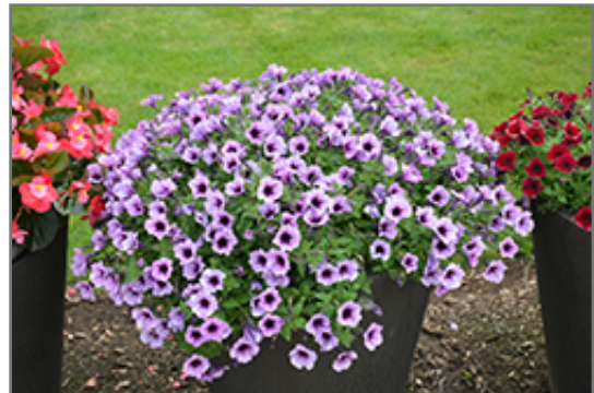
Supertunia Bordeaux Petunia in bloom

Supertunia Bordeaux Petunia is a fine choice for the garden, but it is also a good selection for planting in outdoor containers and hanging baskets. Because of its trailing habit of growth, it is ideally suited for use as a 'spiller' in the 'spiller-thriller-filler' container combination; plant it near the edges where it can spill gracefully over the pot. Note that when growing plants in outdoor containers and baskets, they may require more frequent waterings than they would in the yard or garden.