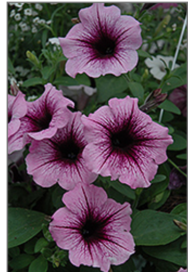
Supertunia Bordeaux Petunia flowers