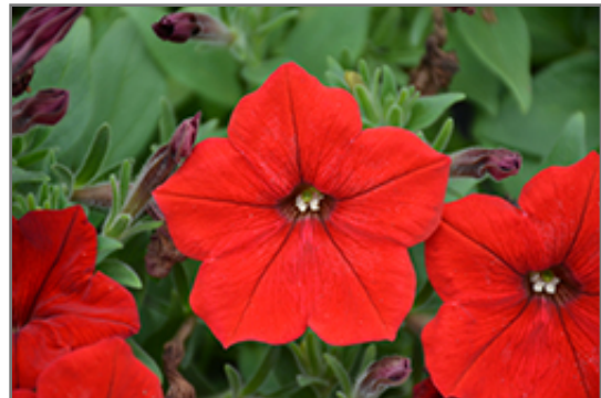
Easy Wave Red Petunia flowers

This plant will require occasional maintenance and upkeep. Trim off the flower heads after they fade and die to encourage more blooms late into the season. It is a good choice for attracting hummingbirds to your yard, but is not particularly attractive to deer who tend to leave it alone in favor of tastier treats. It has no significant negative characteristics.