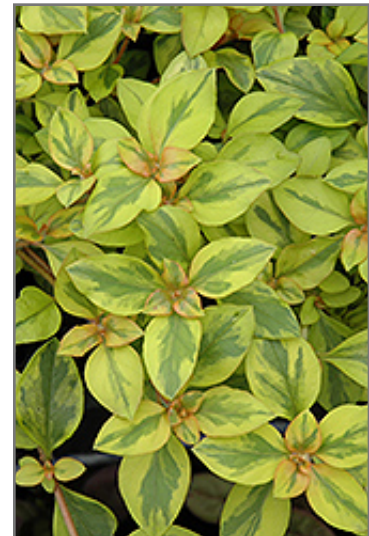
Walkabout Sunset Loosestrife foliage

Walkabout Sunset Loosestrife is recommended for the following landscape applications;