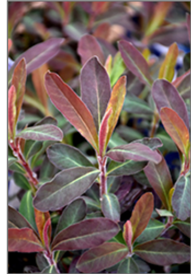
Purple Wood Spurge foliage

Purple Wood Spurge is a fine choice for the garden, but it is also a good selection for planting in outdoor pots and containers. It is often used as a 'filler' in the 'spiller-thriller-filler' container combination, providing a mass of flowers and foliage against which the thriller plants stand out. Note that when growing plants in outdoor containers and baskets, they may require more frequent waterings than they would in the yard or garden.