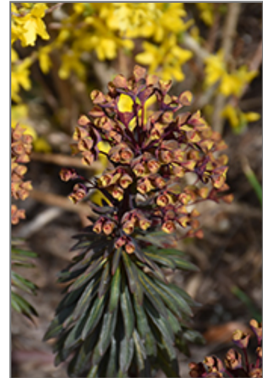
Purple Wood Spurge flower buds