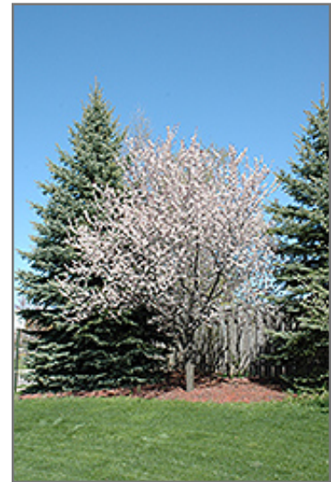
Newport Plum in bloom

This tree should only be grown in full sunlight. It does best in average to evenly moist conditions, but will not tolerate standing water. It is not particular as to soil type or pH. It is highly tolerant of urban pollution and will even thrive in inner city environments. This is a selected variety of a species not originally from North America.