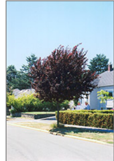
Newport Plum