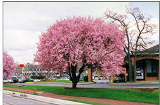
Thundercloud Plum in bloom

Thundercloud Plum is recommended for the following landscape applications;