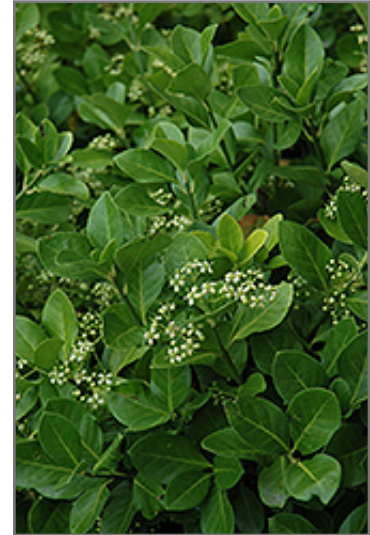
Manhattan Spreading Euonymus flowers

This shrub performs well in both full sun and full shade. It is very adaptable to both dry and moist locations, and should do just fine under average home landscape conditions. It is not particular as to soil type or pH. It is highly tolerant of urban pollution and will even thrive in inner city environments, and will benefit from being planted in a relatively sheltered location. This is a selected variety of a species not originally from North America.