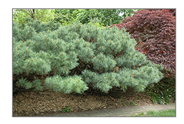
Dwarf White Pine

A high quality evergreen garden shrub with a dense, rounded habit of growth throughout its life, features silvery-blue needles; very compact and slow growing, excellent for form, texture and color detail in home gardens or for rock gardens; needs full sun