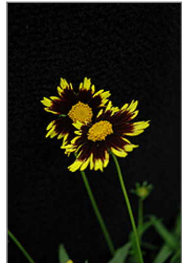
Cosmic Eye Tickseed flowers

Cosmic Eye Tickseed is recommended for the following landscape applications;