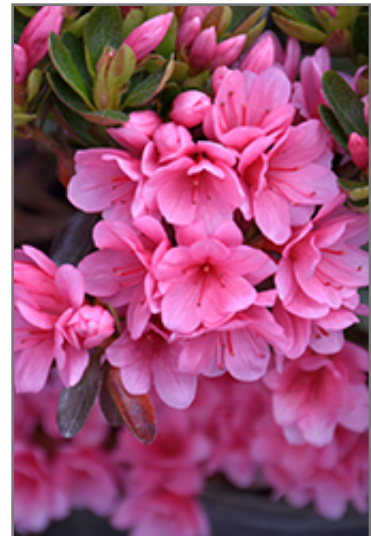
Coral Bells Azalea flowers