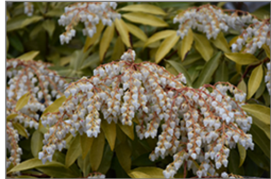
Purity Japanese Pieris flowers