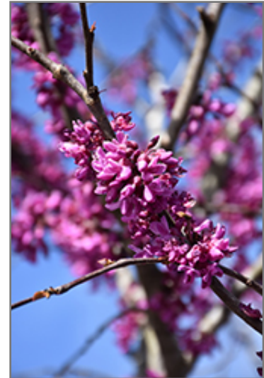
Eastern Redbud (tree form) flowers