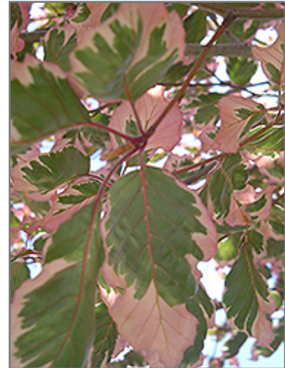
Tricolor Beech foliage