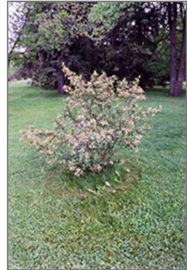
Black Chokeberry in bloom