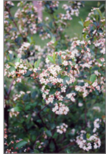
Black Chokeberry flowers

This shrub should only be grown in full sunlight. It is an amazingly adaptable plant, tolerating both dry conditions and even some standing water. It is not particular as to soil type or pH, and is able to handle environmental salt. It is somewhat tolerant of urban pollution. This species is native to parts of North America.