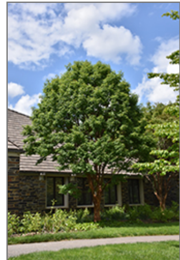
Paperbark Maple